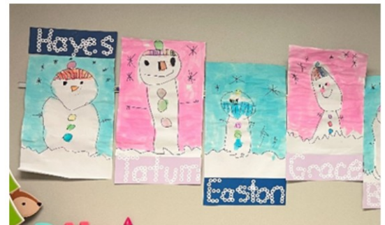
Snowman Directed Drawings