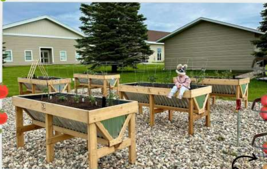
LCCOR garden & produce stand

New to LCCOR - the LCCOR garden & produce stand! If you haven't yet, we encourage everyone to stop by our garden space and take a peek! Located on the west side of the church, behind the garage. Our produce stand is located in the Gathering Space, near the Welcome Center. We'd love for you to drop off any extra produce you may have or take any produce from the stand that you may need.